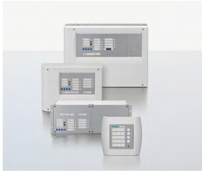
XC10 control panels combine fire detection and extinguishing control and are an ideal solution for room protection, for example of IT rooms.