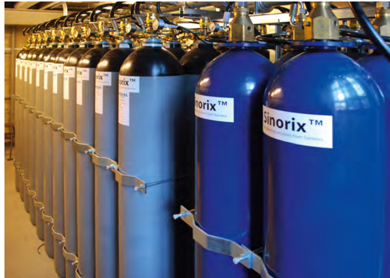
Ideal solutions for comprehensive fire safety: reliable fire detection with Sinteso and efficient extinguishing with Sinorix.